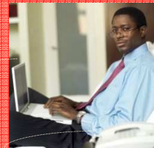
Juvenile Justice Worker