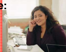
Child Welfare Case Worker

Decision making authority concentrated at the top